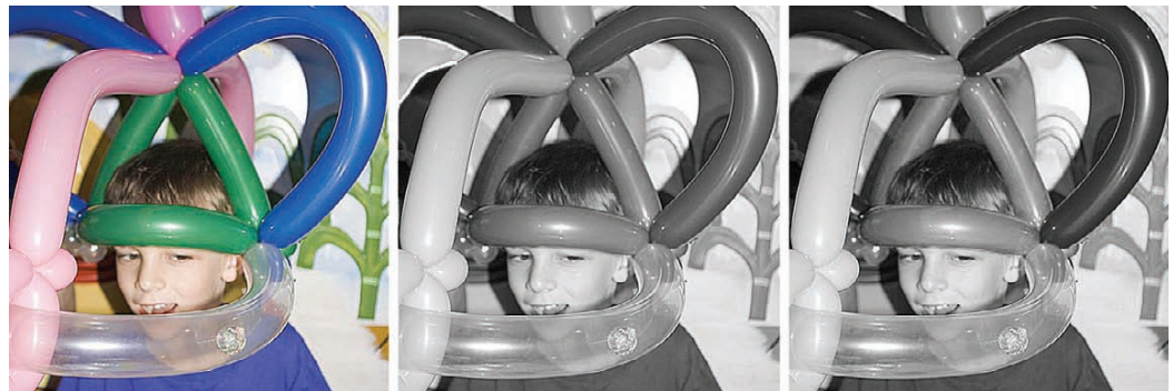
Original RGB image (left); image converted using Mode>Grayscale; image converted with help of Black & White tool.

to the histogram now available in the Curves adjustment window. Now Photoshop users can bring the end points in using Curves, without visiting Levels first. The Curves histogram shows up in light gray underneath the adjustment Curves. Users who want to adjust the highlights and shadows, lighten the midtones, then create an "s" curve to create contrast can do all this in Curves.